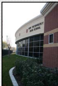
Sacramento New Tech High

Go to the Tours tab and click on Study Tours . Please follow the online instructions to complete your reservation